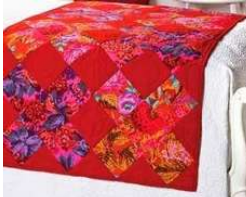
Use large squares of solid red to overshadow the prints containing reds, pinks, purples, and oranges which make the quilt predominantly RED