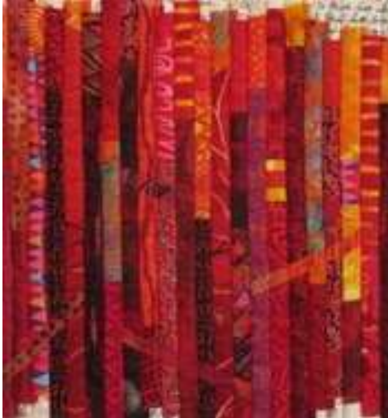
Kaffe Fassett prints are primarily red although some have pink and orange but the main color of the quilts is RED