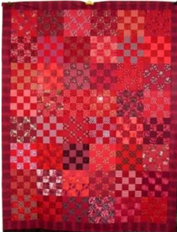
Variety of reds – dark, light, solids, and prints; red hue from burgundy to pink