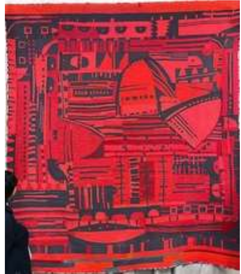
Black is the other color, but red shade is still dominant