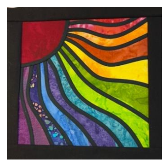
Ready to quilt

Mahalo to all those who participate! Great participation for both the Quarterly Challenge and the Block of the Month.