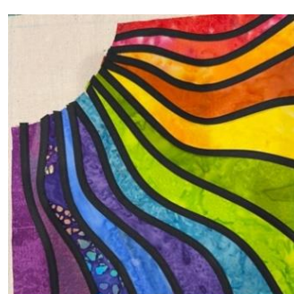
Bias tape attached