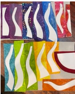
Pieces for fusing