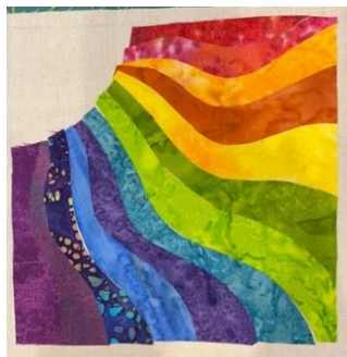
Attached to backing